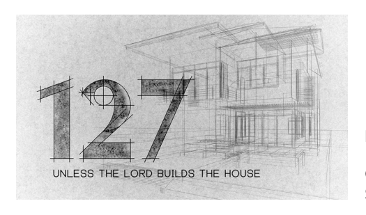
Part 2: Security Systems

Grant Fishbook, Teaching Pastor September 13 & 14, 2014