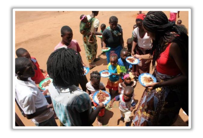
Malawians getting food at Christmas party.

One of the biggest blessings is to be able to provide nutrition for the families in Area 23. The local church was able to target those families who were near starvation and provide them with food. In total NBCTK was able to help provide for over 700 people.